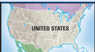
UNITED STATES IN 1853