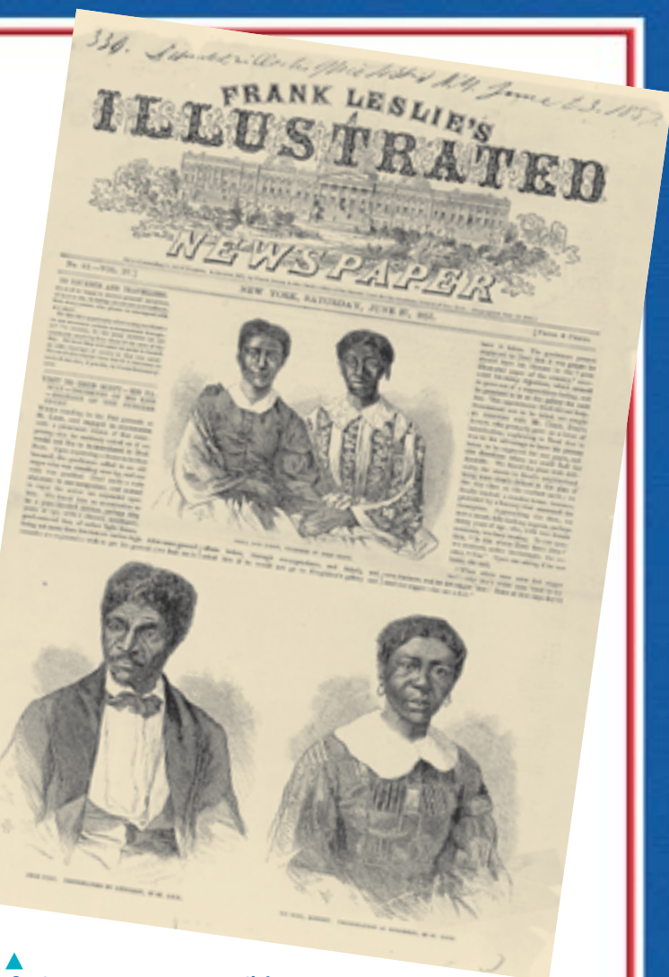
▲ Contemporary newspaper article describing the Dred Scott case.

It took four years of bitter civil war to find out if Taney's opinion would stand as the law of the land. It would not. Immediately after the Civil War, the federal government moved to abolish slavery with the Thirteenth Amendment (1865) and then to extend state and national citizenship with the Fourteenth Amendment (1868) to "[a]ll persons born or naturalized in the United States." The wording of these amend-