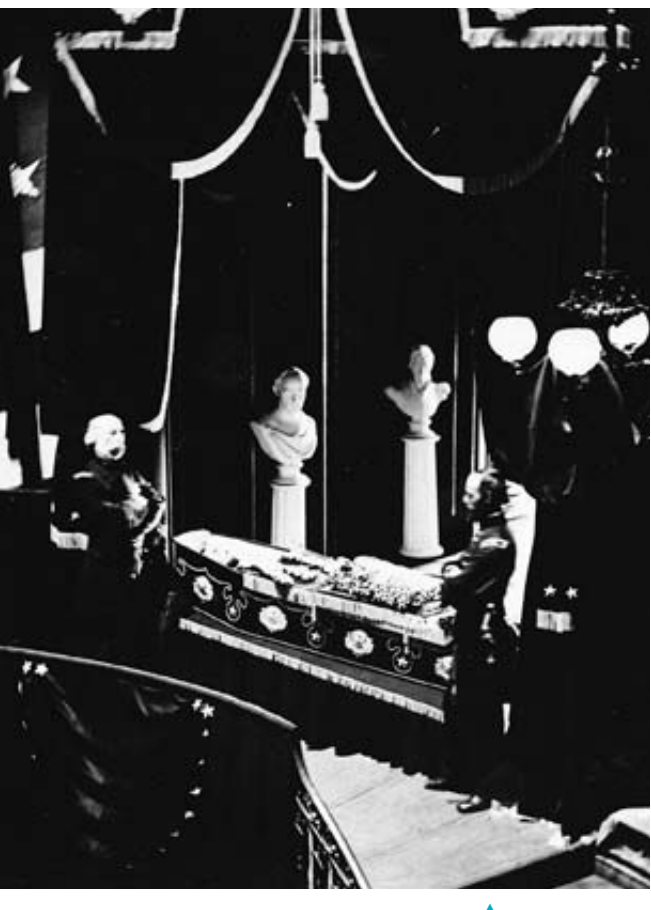
Lincoln's body lies in state.

how to restore the Southern states to the Union and how to integrate approximately 4 million newly freed African Americans into national life.