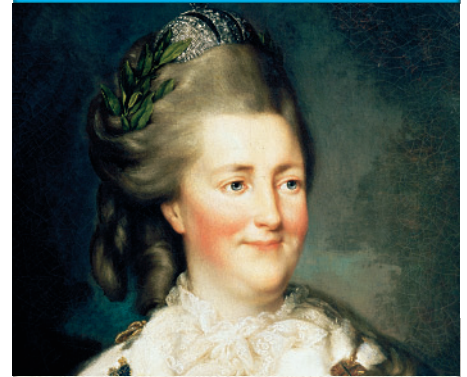
Catherine the Great 1729–1796

The daughter of a minor German prince, Catherine was 15 when she was handed over to marry the Grand Duke Peter, heir to the Russian throne.