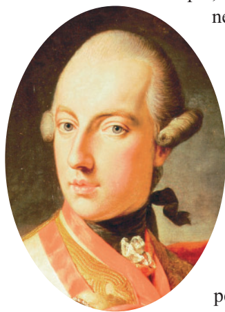
▲ Joseph II

Catherine eventually put in place limited reforms, but she did little to improve the life of the Russian peasants. Her views about enlightened ideas changed after a massive uprising of serfs in 1773. With great brutality, Catherine's army crushed the