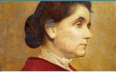
Jane Addams 1860–1935

After graduating from college, Jane Addams wondered what to do with her life.