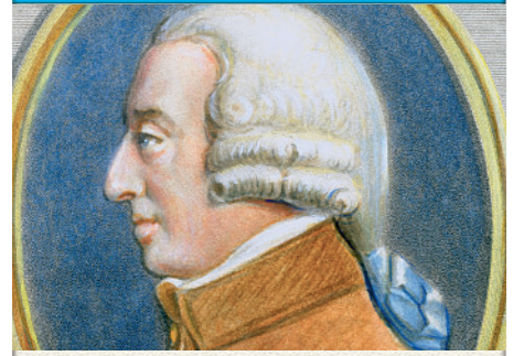
Adam Smith 1723–1790

In his book The Wealth of Nations , Smith argued that if individuals freely followed their own self-interest, the world would be an orderly and progressive place. Social harmony would result without any government direction, “as if by an invisible hand.”