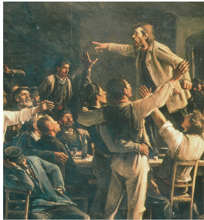
▲ Hungarian workers meet to plan their strategy before a strike.

In 1919, the U.S. Supreme Court objected to a federal child labor law, ruling that it interfered with states' rights to regulate labor. However, individual states were allowed to limit the working hours of women and, later, of men.