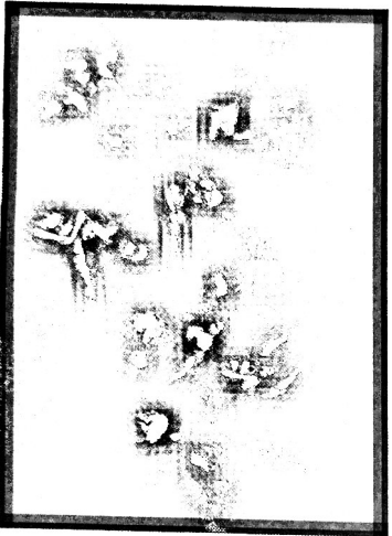
Salem Witch Trials

Between June and October, twenty people were convicted of witchcraft and killed and more than a hundred suspected witches remained in jail.