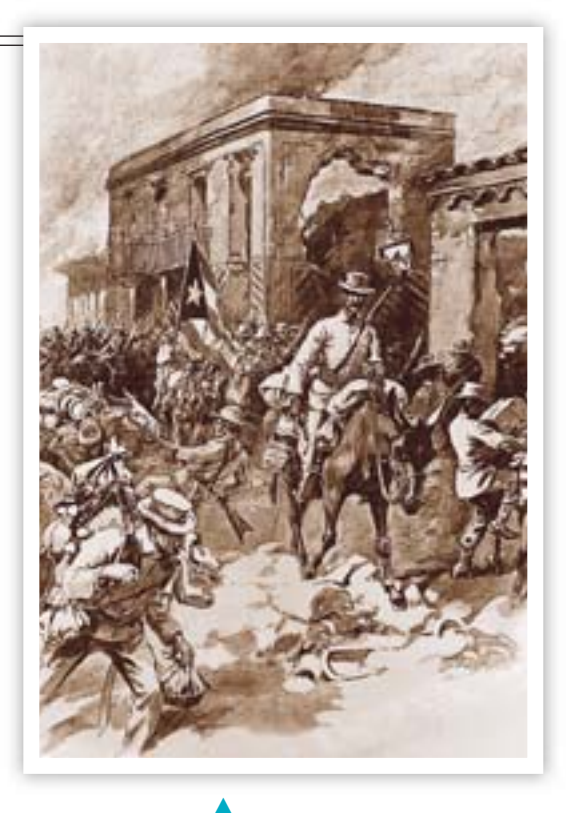
Cuban rebels burn the town of Jaruco in March 1896.

Newspapers during that period often exaggerated stories like Creelman's to boost their sales as well as to provoke American intervention in Cuba.