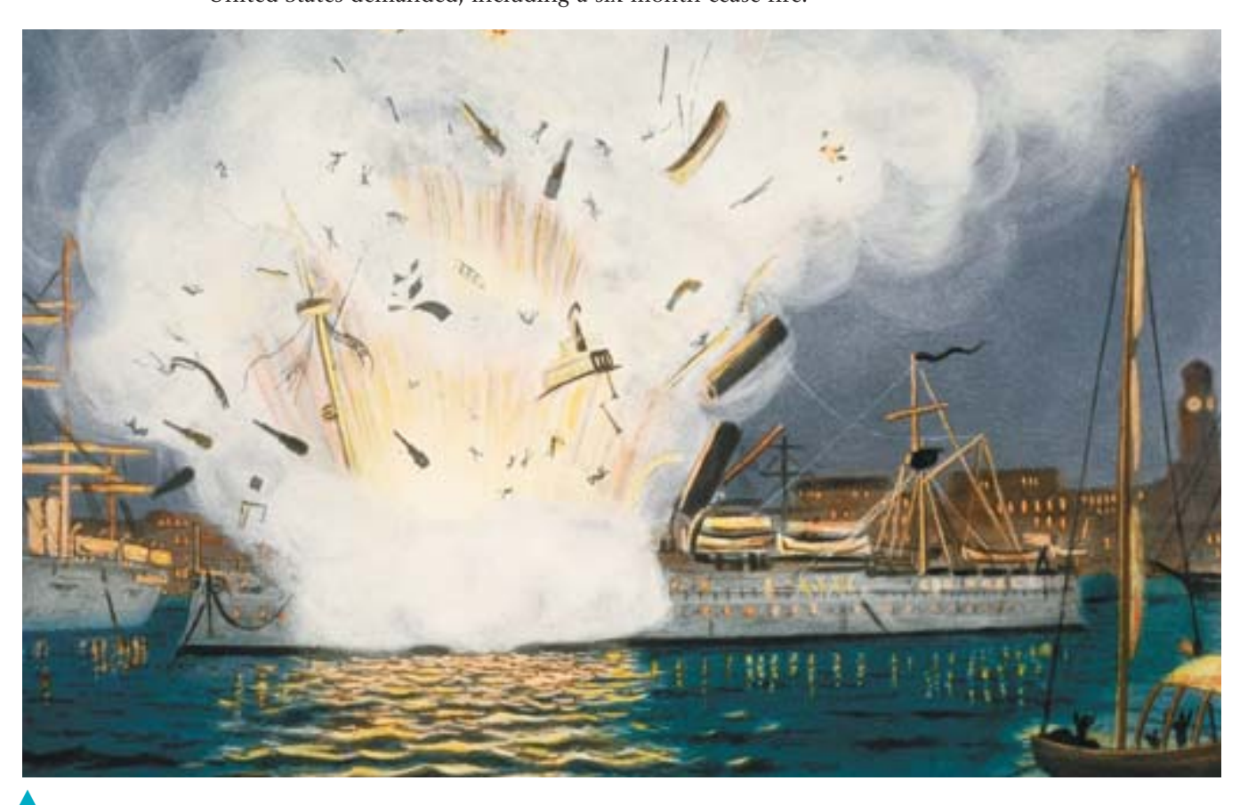
When the U.S.S. Maine exploded in the harbor of Havana, newspapers like the New York Journal were quick to place the blame on Spain.

Now there was no holding back the forces that wanted war. "Remember the Maine! " became the rallying cry for U.S. intervention in Cuba. It made no difference that the Spanish government agreed, on April 9, to almost everything the United States demanded, including a six-month cease-fire.