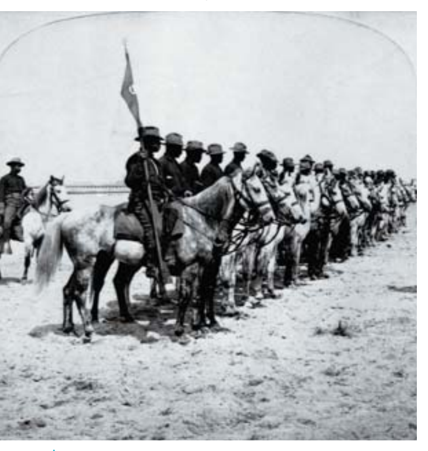
These African-American troops prepare for battle during the Spanish-American War.

The Rough Riders trained as cavalry but fought on foot because their horses didn't reach Cuba in time.