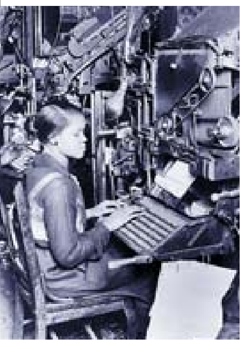
A young woman works as a typesetter in a publishing house in 1920.

NEW WORK OPPORTUNITIES Although women had worked successfully during the war, afterwards employers who believed that men had the responsibility to support their families financially often replaced female workers with men. Women continued to seek paid employment, but their opportunities changed. Many female college graduates turned to "women's professions" and became teachers, nurses, and librarians. Big businesses required extensive correspondence and record keeping, creating a huge demand for clerical workers such as typists, filing clerks, secretaries, stenographers, and office-machine operators. Others became clerks in stores or held jobs on assembly lines. A handful of women broke the old stereotypes by doing work once reserved for men, such as flying airplanes, driving taxis, and drilling oil wells.