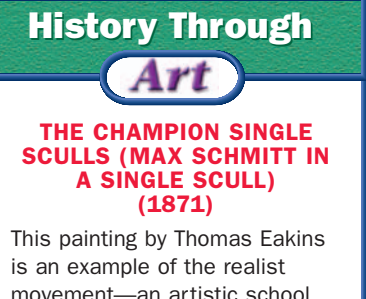
Image not available for use on CD-ROM. Please refer to the image in the textbook.

is an example of the realist movement—an artistic school that aimed at portraying people and environments as they really are.