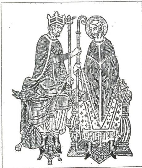
A woodcut of a king (wearing a crown) giving the staff (a symbol of the office) to a bishop)

Obviously, the pope was vigorously opposed to this, and a struggle ensued between lay leaders and the pope.